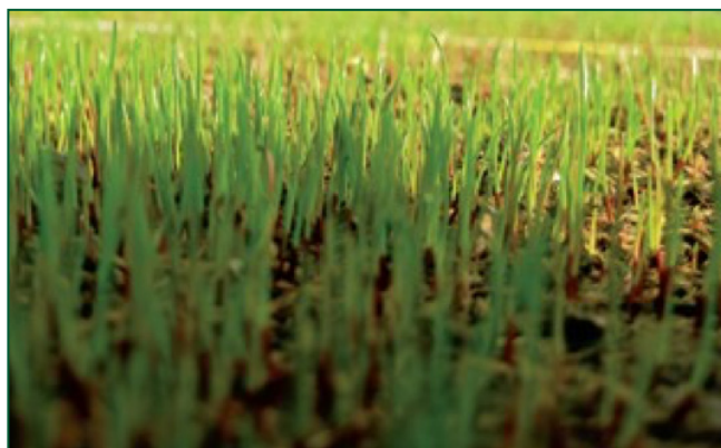
Figure 1: Overseeded sports field