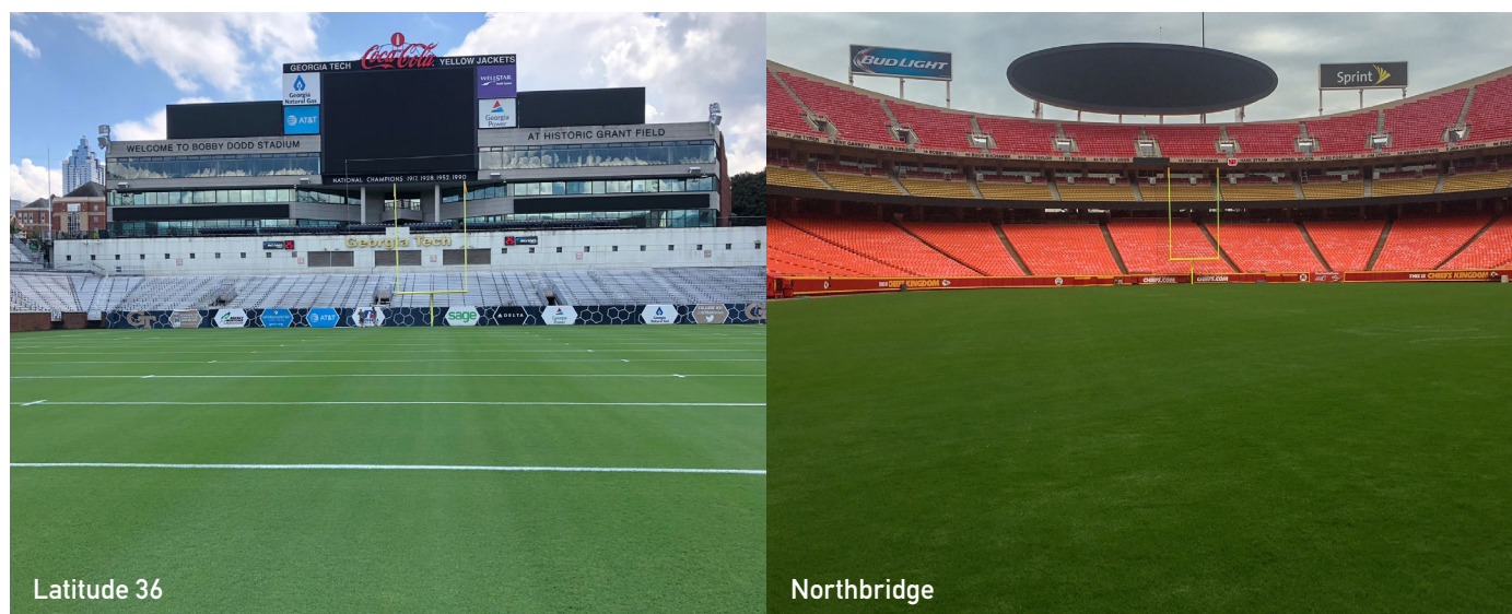
Figure 2. Bermudagrass sports fields.

Whether a little league field or an NFL field, bermudagrass is almost the only choice for athletic fields in the transition zone (Fig. 2). Budgetary concerns can be met by making the correct bermudagrass selection for your situation. There are numerous bermudagrass cultivars available that can be purchased at different expense levels.