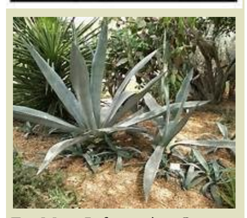
For More Information Contact:

Texas A&M AgriLife Extension Service— Nueces County 710 E. Main, Suite 1 Robstown, TX 78380 (361) 767-5217