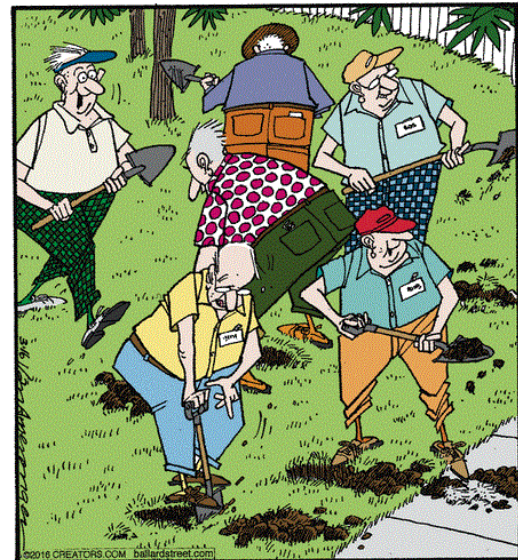
Another Master Gardener project begins.

Read more: http://www.smithsonianmag.com/science-nature/photos-of-the-worlds-oldest-living-things-164321082/#8tW0XT2ScPFIOjsD.99