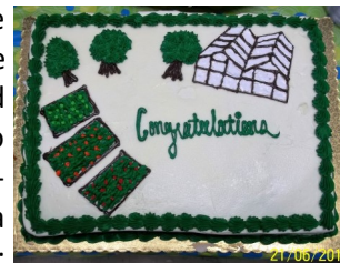
Cake honoring the award winner at the monthly luncheon/meeting